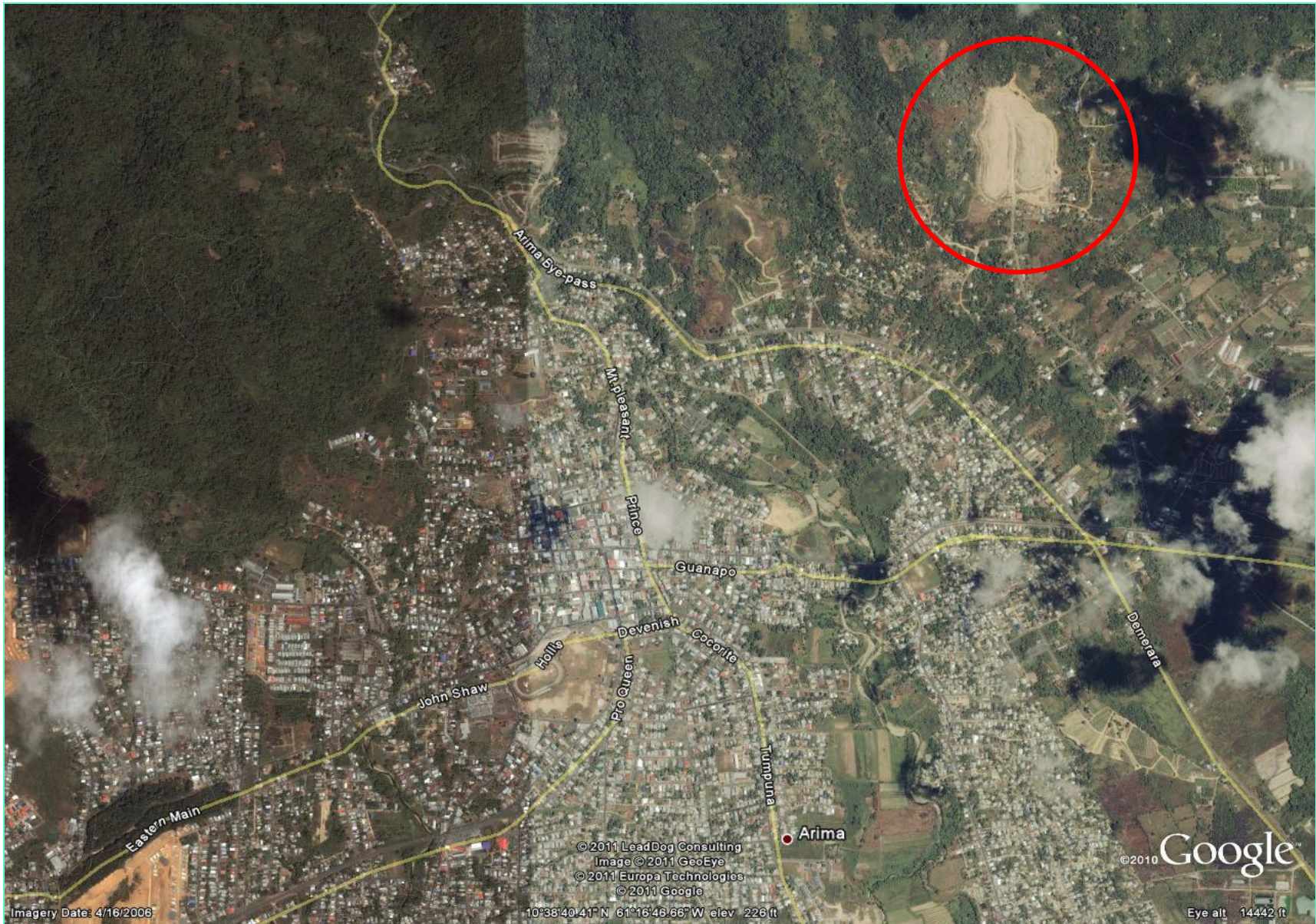
Proximity of Landfill to settlements