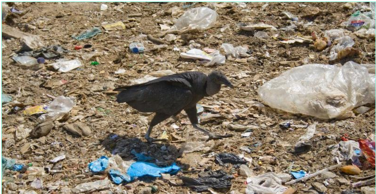
Figure 4 : Scavenger at Guanapo Landfill