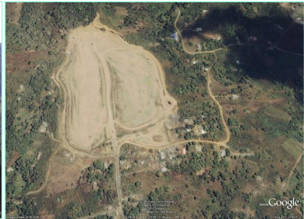
Figure 3(right): Close up image of Guanapo Landfill