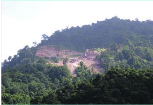
Figure 2( left) : Heights of Guanapo showing quarrying